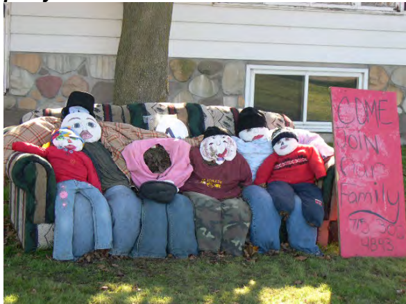
O'Leary's won with the farmer scarecrow